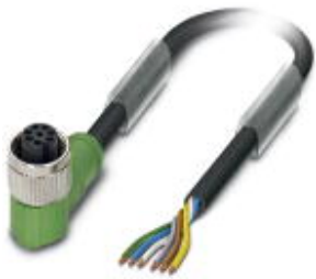
M12 socket, angled, 6-pos., with connected master cable, for sensor/actuator box with M8 slots, cable length: 5 m

Please be informed that the data shown in this PDF Document is generated from our Online Catalog. Please find the complete data in the user's documentation. Our General Terms of Use for Downloads are valid ( http://phoenixcontact.com/download )