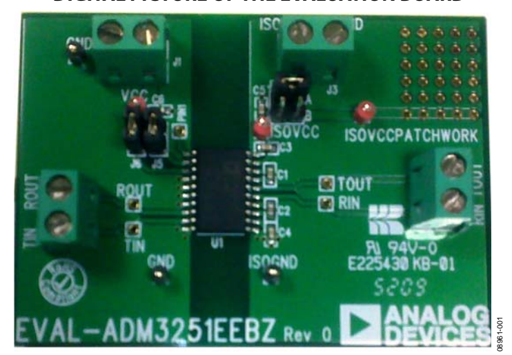
Figure 1. ADM3251E Evaluation Board