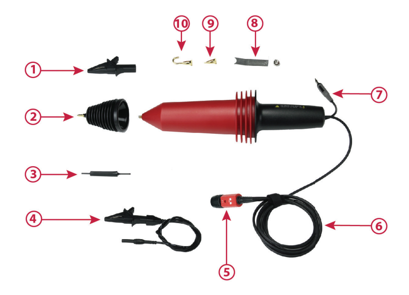
Figure 1: CT4028 Probe Accessories