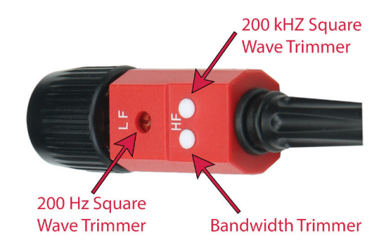
Figure 3: Frequency Compensation Trimmer