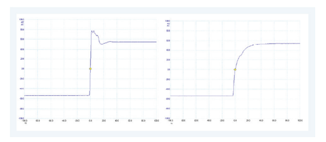
Figure 4: Over/Under Compensation

Figure 4 shows how over- and under-compensated pulse responses will look.